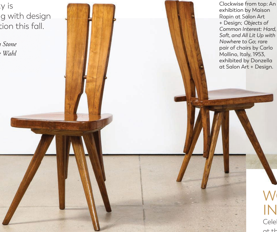
Clockwise from top: An exhibition by Maison Rapin at Salon Art + Design; Objects of Common Interest: Hard, Soft, and All Lit Up with Nowhere to Go ; rare pair of chairs by Carlo Molino, Italy, 1953, exhibited by Donzella at Salon Art + Design.